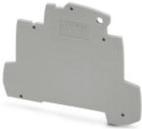
End cover for terminating a row of TERMITRAB complete TTC-6... terminal blocks

Please be informed that the data shown in this PDF Document is generated from our Online Catalog. Please find the complete data in the user's documentation. Our General Terms of Use for Downloads are valid ( http://phoenixcontact.com/download )